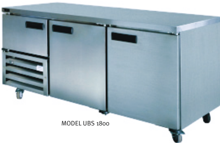
MODEL UBS 1800