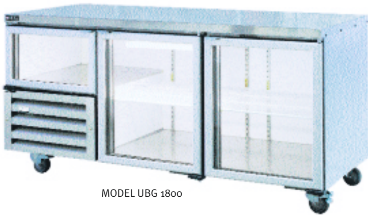
MODEL UBG 1800